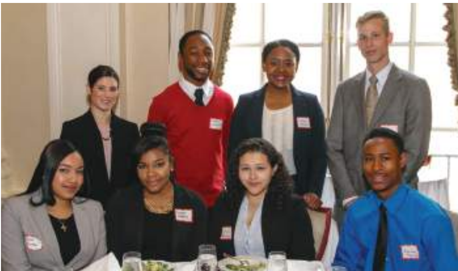
Students from Vaughn College