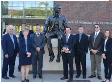
Purdue University Group