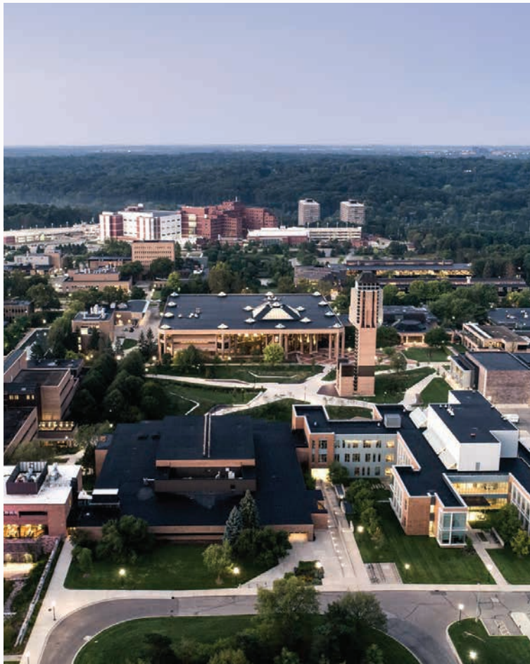
University of Michigan Campus