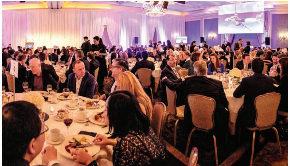
Sold-out crowd in the Grand Ball Room