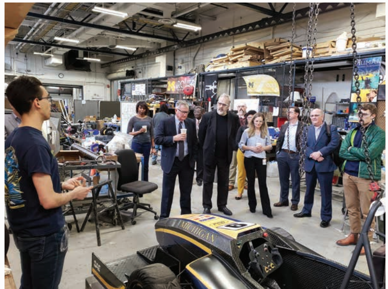
Class room session for group