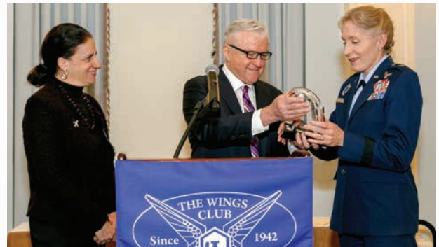
Presentation of the award