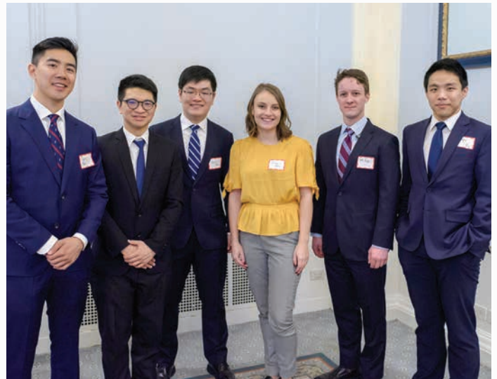
Students from New York University