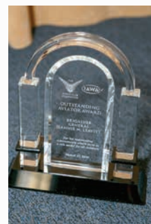
10th Annual Outstanding Aviator Award