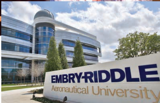
Embry-Riddle Aeronautical University