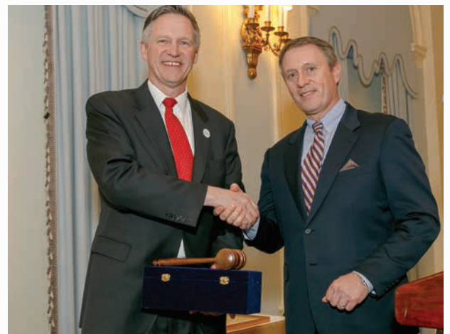
Exchange of the Gavel