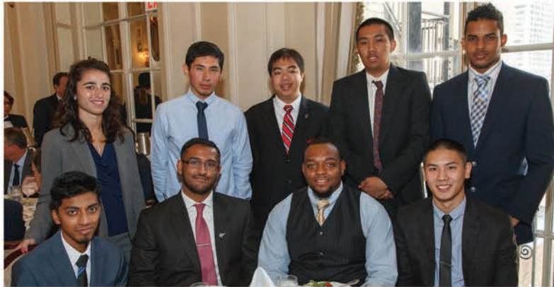
Students from Vaughn College of Aeronautics & Technology