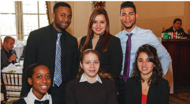
Aviation High School Students