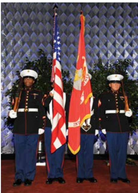
U.S. Marine Corps Color Guard