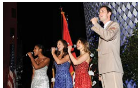
USO Liberty Bell Singers